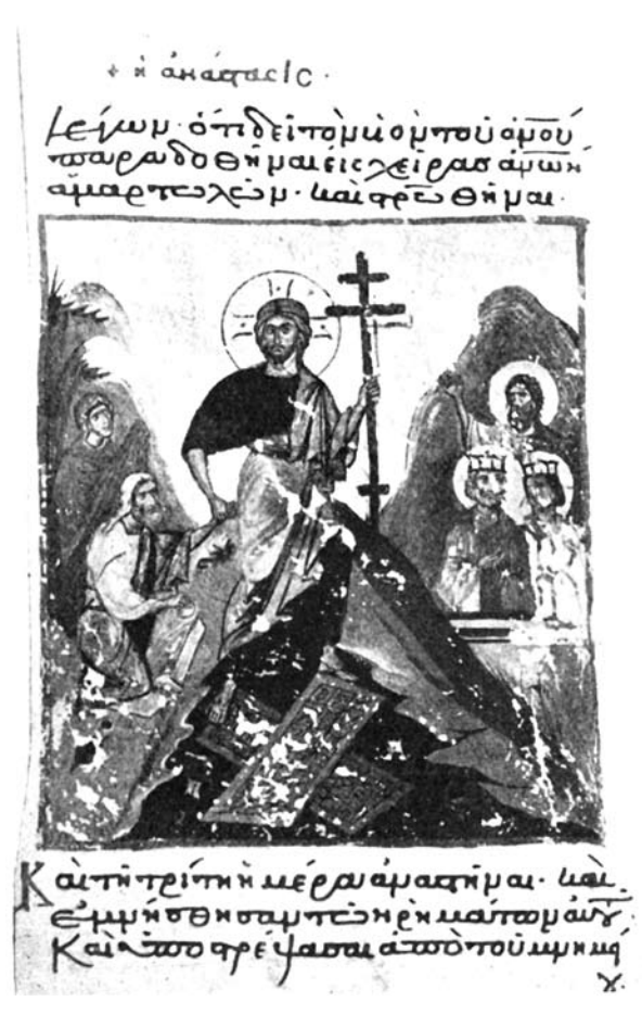
Jesus' descent to the dead, 12th century book of the Gospels

"If forgiveness is not truly sought after or desired, then God will not offer it. The proper attitude is a yearning to be reunited to God."