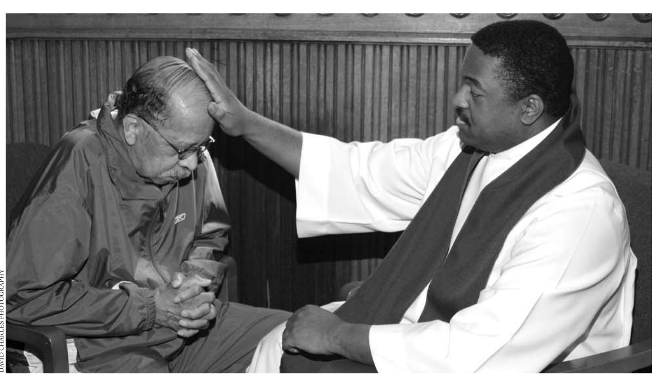
Reconciliation is a sacrament of mercy and healing

Proper reception of the sacrament provides sac-